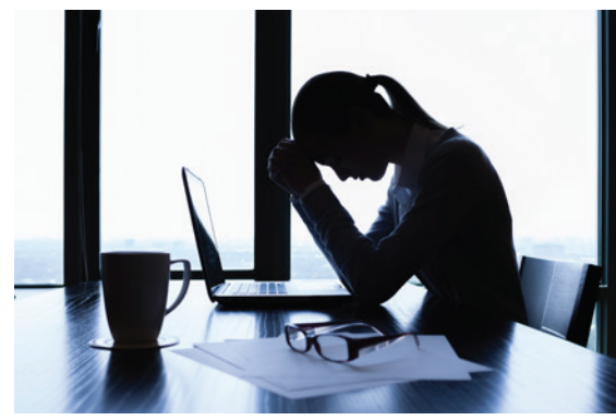
See Page 1. We have the answer!